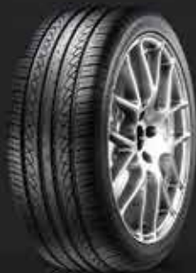
CHAMPRO UHP AS