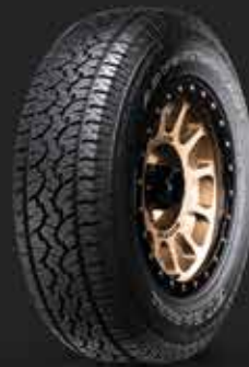
ADVENTURO AT 3