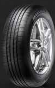
MAXTOUR ALL SEASON