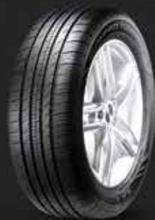
CHAMPRO TOURING A/S